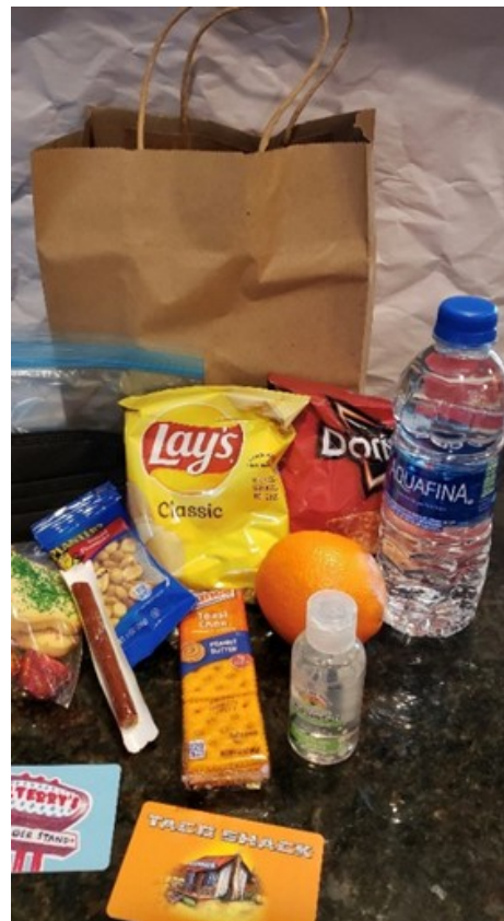
12/25/2020 Christmas "dinner" at the church during the Covid 19 pandemic