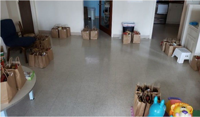
12/25/2020 Visualize all the Covid 19 Christmas "dinner" helpers standing in the middle of the nursery surrounded by bags of food, hand sanitizer and treats